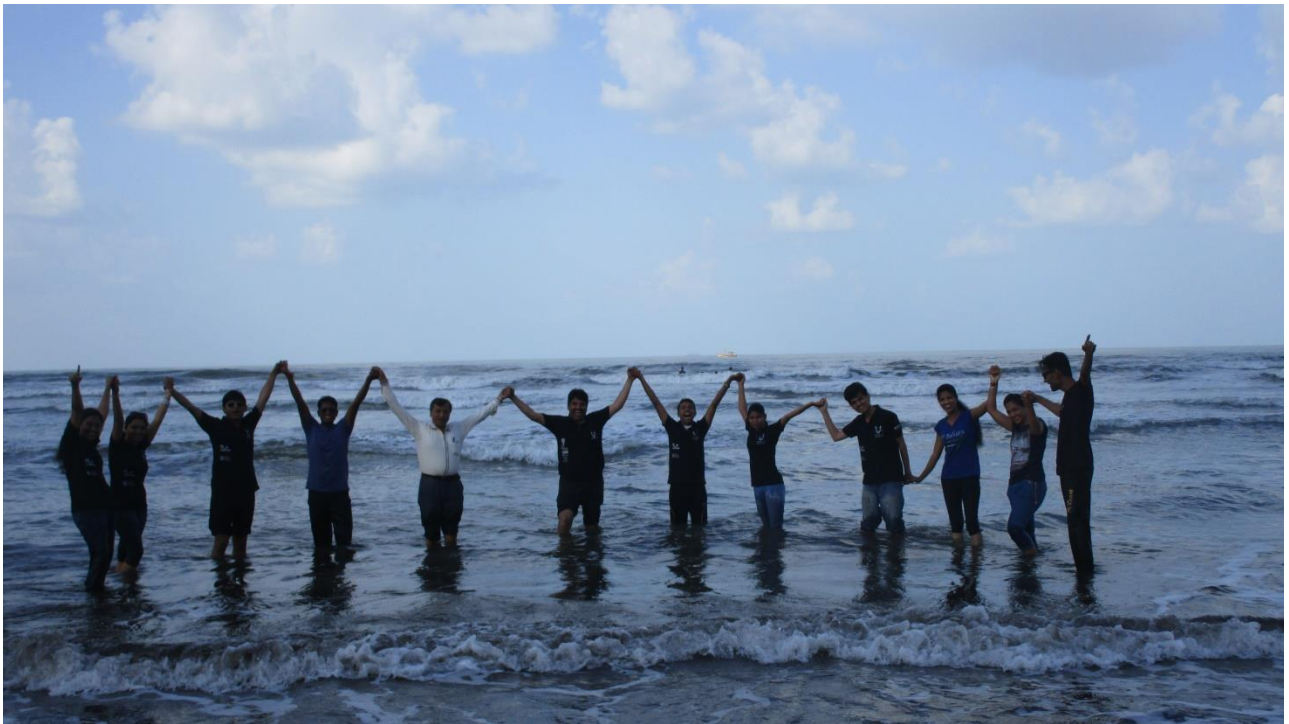
Industrial Visit at Harihareshwar