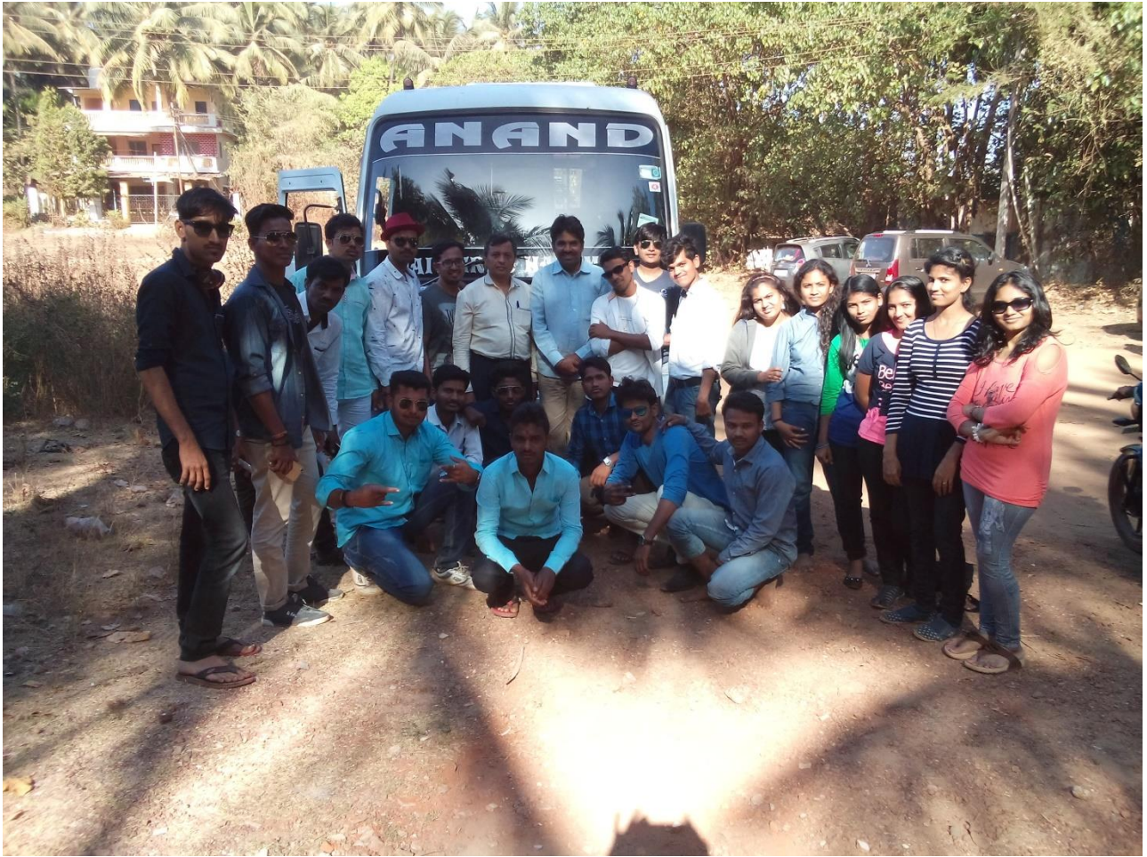
Industrial Visit at Divvy Agar