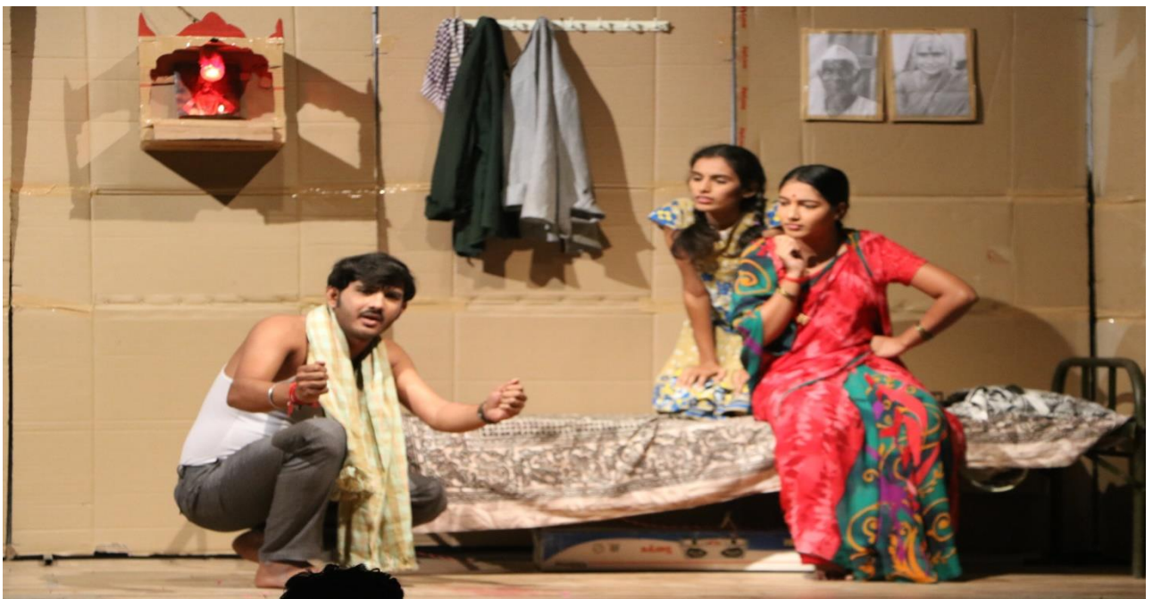
One Act Play Driver performed by IBMRD at Shahu Modhak Intercollege Competition.