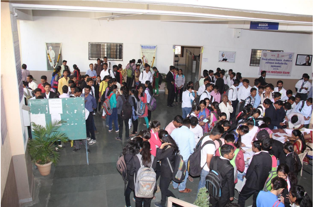
Job fair organized by IBMRD with collaboration with Government Employment Office Ahmednagar on 27 th Feb 2017