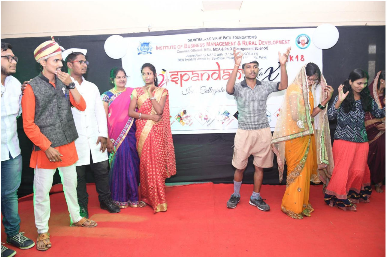
Spandan Mex / Dance Competition