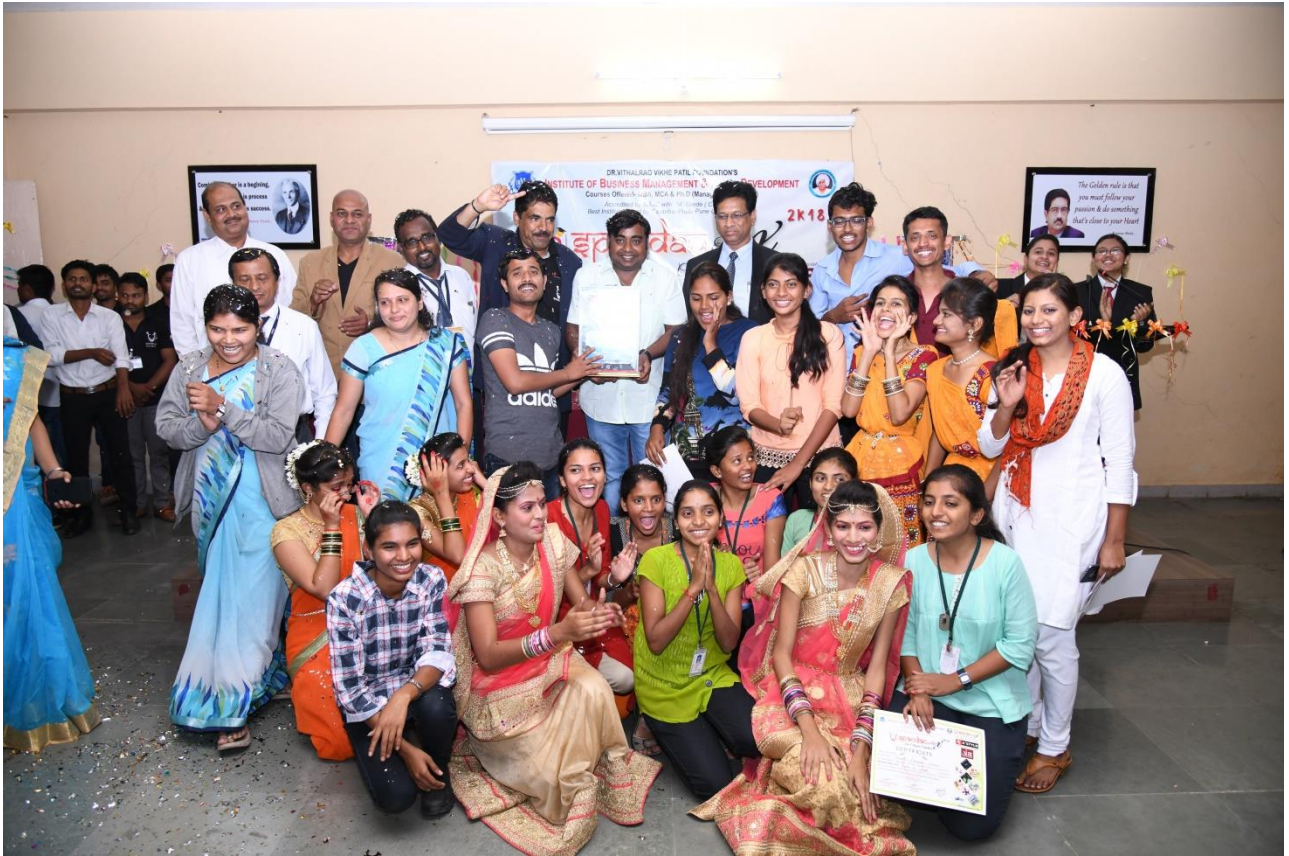
Spandan Mex Championship Trophy Received by College of Agriculture Ahmednagar ViladGhat