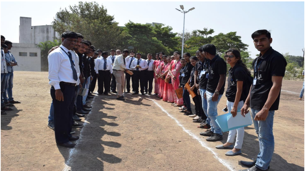
Spandan Mex Cricket Competition Inauguration