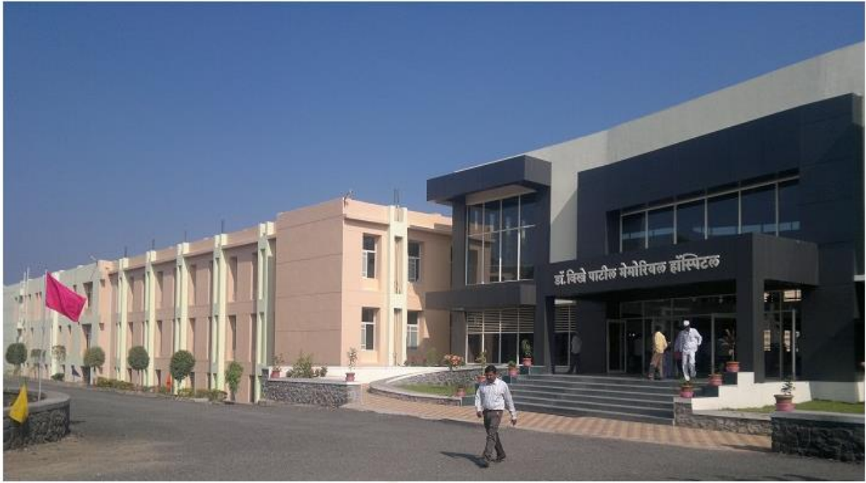
DR. VIKHE PATIL MEMORIAL HOSPITAL