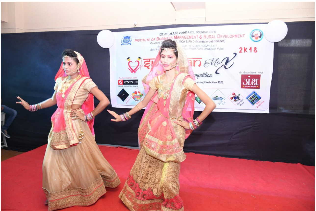
Spandan cultural programme