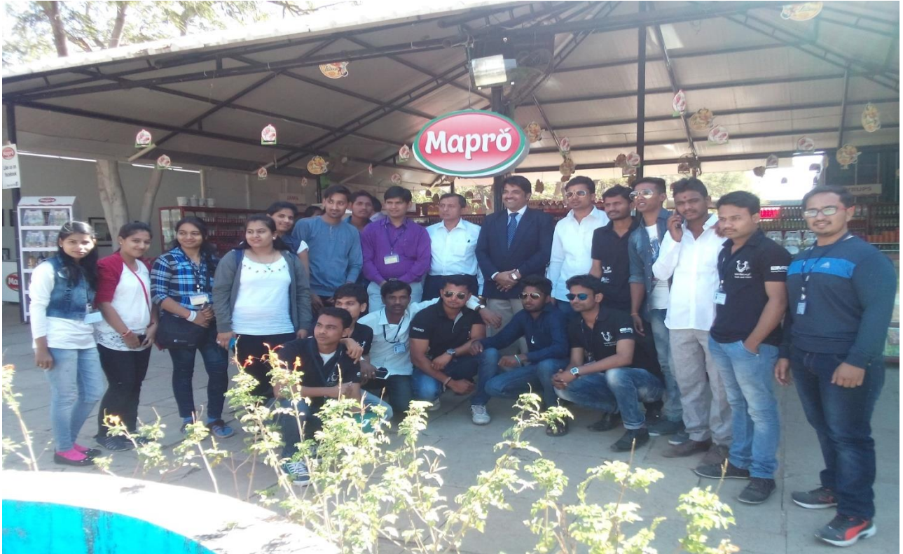
MBA / MCA Industrial Visit Mahabaleshwar (Wai) on 10 th and 11 th March 2017