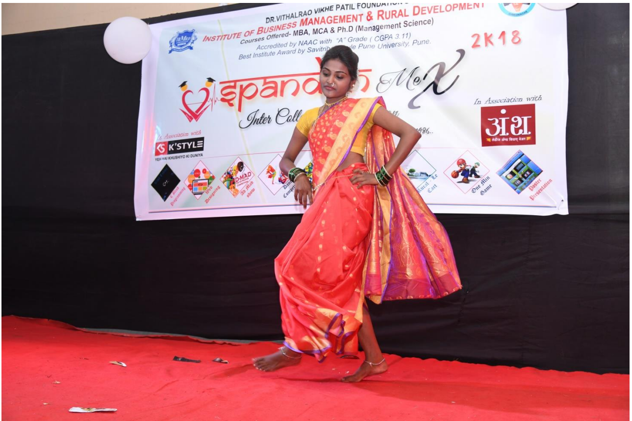
Solo Dance at Spandan Mex 2018