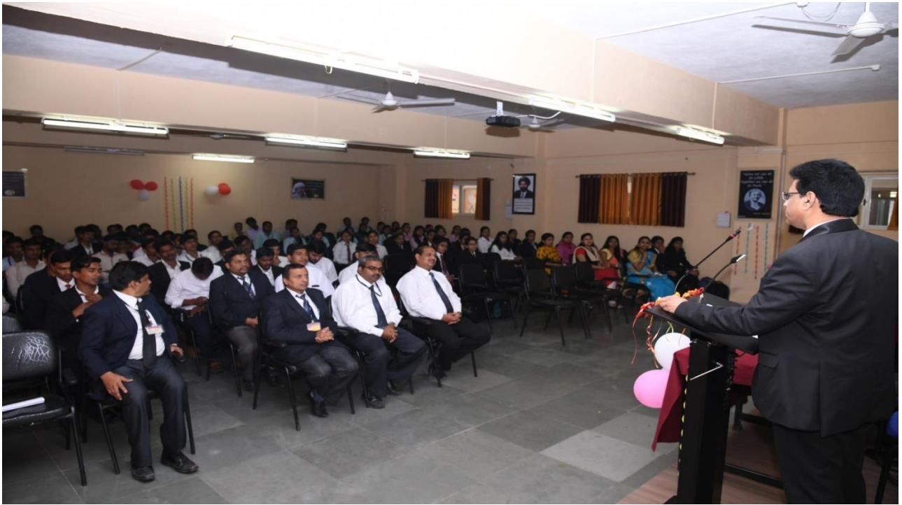
Spandan Mex Address by Hon. Director